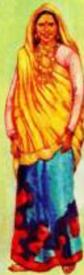
Cotton Silk Handloom