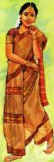
Chikoo Brown & Maroon Silk