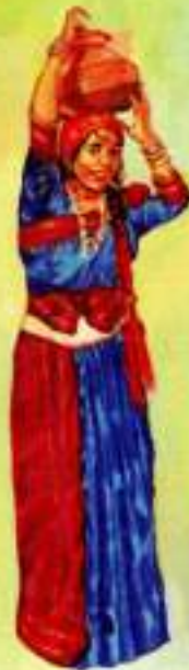
Gadwal Pattu Handloom