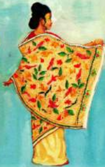
Kantha Tussar Silk