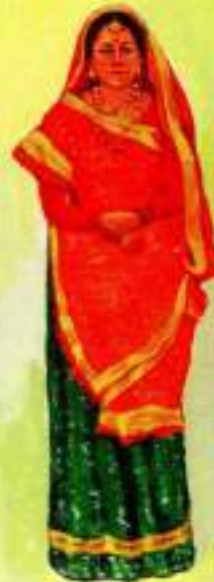
Pure Silk Handloom