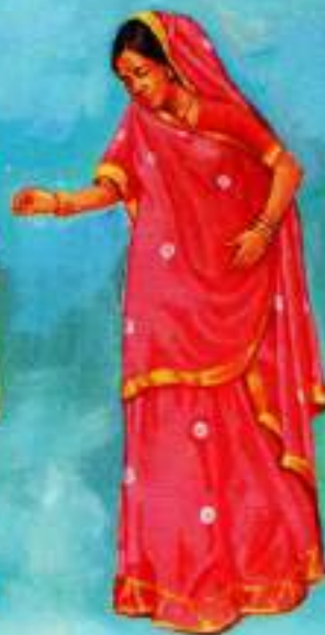
Maheshwari & Chanderi